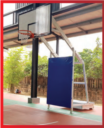
With Aluminium Backboard - Order No. SP 100250