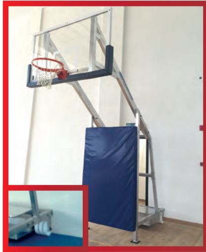
With Acrylic Backboard - Order No. SP 100251